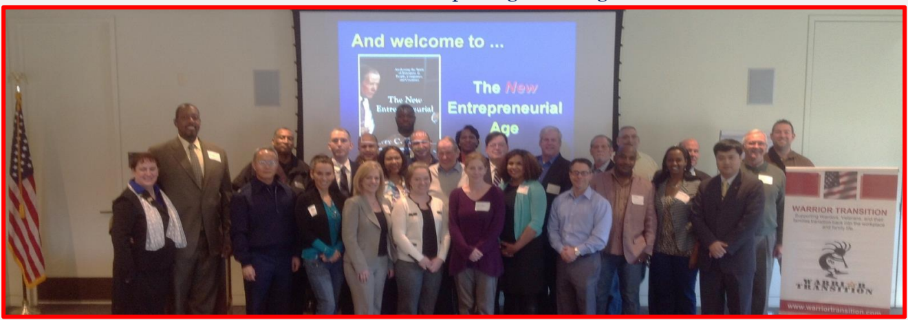
The first Warrior Transition-Getting Entrepreneurial Seminar: Fort Belvoir, Virginia, 2014

Therefore we're happy to announce that the next program is scheduled to run in February 2015 at Camp Lejeune, the famous US Marine base in North Carolina. We're expecting another great turnout and seminar!