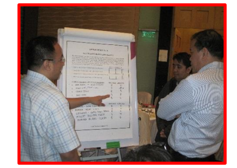
Small Team Applications